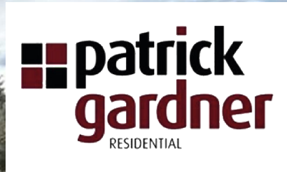
33 Marley Rise, Dorking, Surrey, RH4 3DY